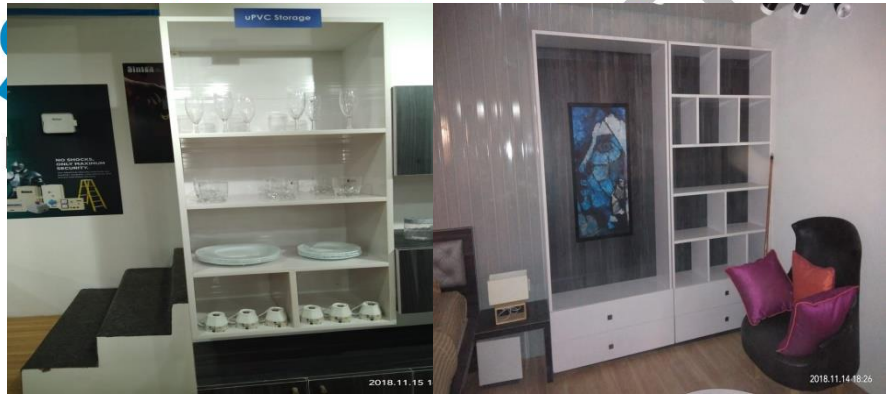
Sintex Plastics Technology Ltd